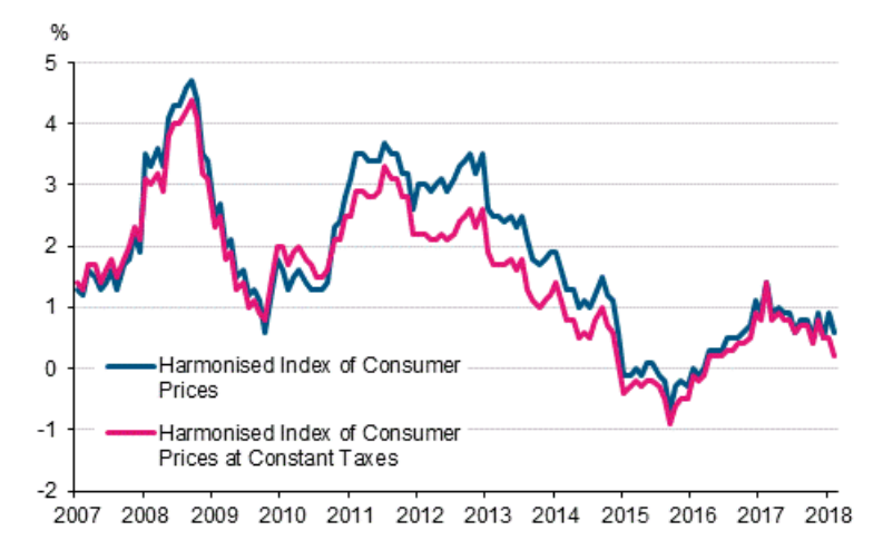
Appendix figure 4. Harmonised Index of Consumer Price Index 2015=100; Finland, euro area and EU

Appendix figure 3. Annual change in the Harmonised Index of Consumer Prices and the Harmonised Index of Consumer Prices at Constant Taxes, January 2007 - February 2018