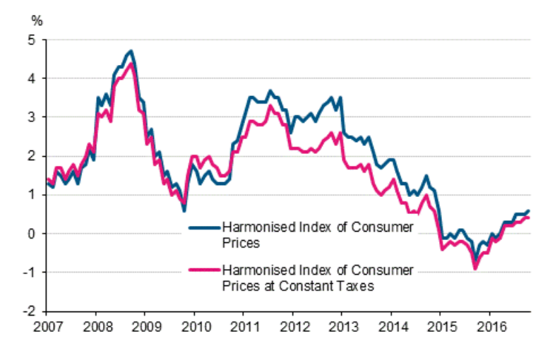
Appendix figure 4. Harmonised Index of Consumer Price Index 2015=100; Finland, euro area and EU

Appendix figure 3. Annual change in the Harmonised Index of Consumer Prices and the Harmonised Index of Consumer Prices at Constant Taxes, January 2007 - October 2016